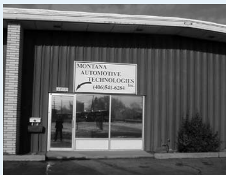
In providing mentors and hands-on training, Montana Automotive Technologies is committed to providing traditional and vocational instruction to Missoula-area youth.