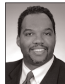
Senator Lance Mason

* Visit www.semasan.com for a complete listing of Caucus members.