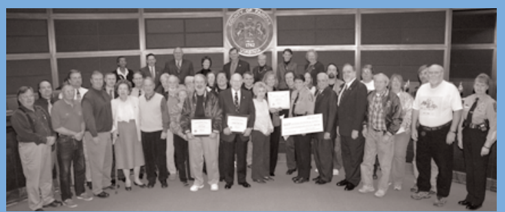
On January 8, 2007, the Fairfax County Board of Supervisors recognized the Custom Cruisers of Northern Virginia and the Clifton Lions Club for their donation of $32,000 to families of two Fairfax County Police Officers killed in the line of duty.