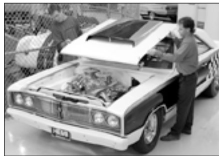
Enthusiasts in Kentucky now have legal protection to finish work on their own hobby cars—as long as the projects are out of public view.

In recent years, states and localities have passed strict property or zoning laws that include restrictions on visible inoperable automobile bodies and parts. Removal of these vehicles from private property is often enforced through local nuisance laws with minimal or no notice to the owner. Elected officials develop these initiatives based on the notion that inoperable vehicles are eyesores that adversely affect property values. Many such laws are drafted broadly, allowing for the confiscation of vehicles being repaired or restored.