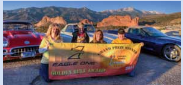
Colorado Springs Corvette Club members show off their well-deserved Eagle One Golden Rule Award against the backdrop of the Rocky Mountains and a few good-lookin' Vettes.

As we all know, our love of cars unites us all to give back to the community we live in. We organize things such as shows, cruise-ins and track days to raise funds for needy causes and to educate the public. For 18 years, Eagle One has recognized the philanthropy efforts of the nation's car clubs and enthusiasts to show that there is more to car clubs than just a love of automobiles. Eagle One's Golden Rule Awards showcase the great support of community that local car clubs provide.