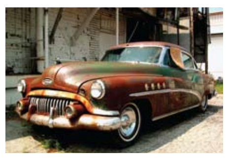
Once signed by the governor, the new law will provide protections to automotive hobbyists by exempting them from restrictions imposed on salvage yards.

is determined to be of historical, classic or exhibition value. The $100 one-time fee would replace the current annual fee of $28.75.