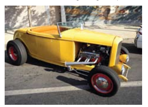
The legislation would allow for more specially constructed vehicles to be registered with an exemption each year.

California Specially Constructed Vehicles: The California State Assembly approved SAN-supported legislation to increase the registration limit for exempted specially constructed vehicle registrations