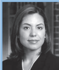
CALIFORNIA Assemblymember Nicole Parra