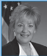
NEW YORK Assemblymember Ginny Fields