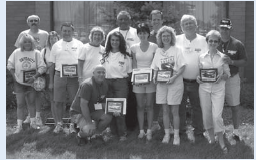
Members of the East Coast Camaro Club posed at the 31st Chevy International Show in Ohio.

For more details on the All Vehicle Show in September or the East Coast Camaro Club, visit the club's website at www.eastcoastcamaroclub.com .