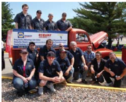
Club members worked to complete this '50 Ford F-1 truck before the Hot Rod Magazine Power Tour rolled into town.

restored truck completed just hours before the event. All the bodywork, wiring and mechanical work were done by RCTC auto students. This is extremely impressive considering RCTC does not teach body repair and painting.