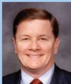
CALIFORNIA State Senator Dave Cogdill

* For a complete list of Caucus members, visit www.semasan.com