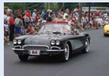
Starting with 25 Corvette enthusiasts in 1958, the club now has over 500 members and growing.

For more information on the club, visit www.ccdv.com .