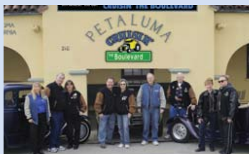
For their efforts in donating 21 Automated External Defibrillators for use by local law enforcement, in high schools and in City Hall, the Cruisin' The Boulevard Car Club of Petaluma, California, was chosen as the Eagle One Grand Prize winner in 2008.

choice. Three other winners will receive a $500 cash contribution for a charity of their choice. The grand prize will be awarded to the car club judged to have performed the most compassionate achievement during 2008. Winners will be selected in four regions—west, midwest, east and south—for conducting the most outstanding community service program in their area during 2008.