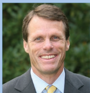
CALIFORNIA Assemblymember Ted Gaines

* Visit www.semasan.com for a complete list of caucus members.