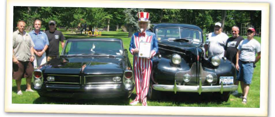
Collector Car Appreciation Day, Troy, New York.