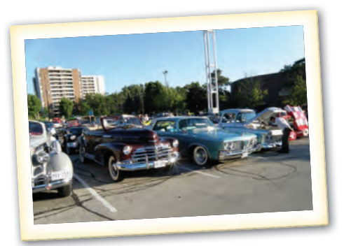
Thornhill Cruisers Car Club, Thornhill, Ontario, Canada.