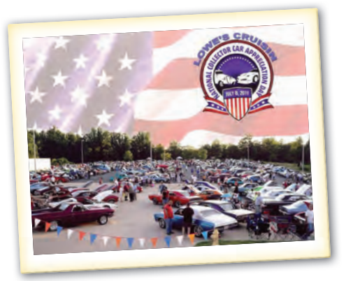
Lowe's Cruise, Abingdon, Maryland.