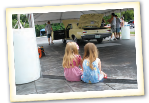
24th Midwest Chevelle Regional, Springfield, Missouri.