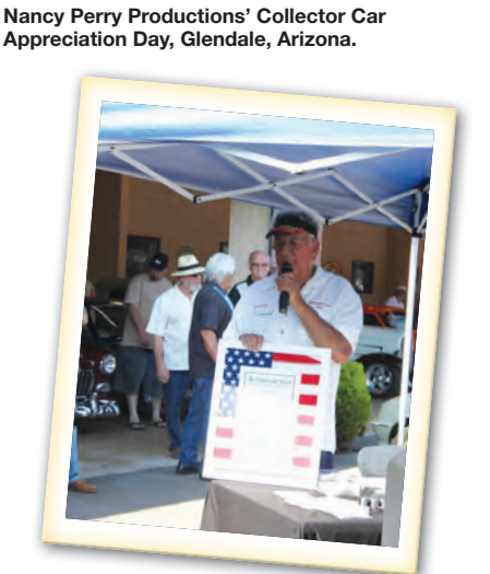
American Classic Cars. Pomona, California.