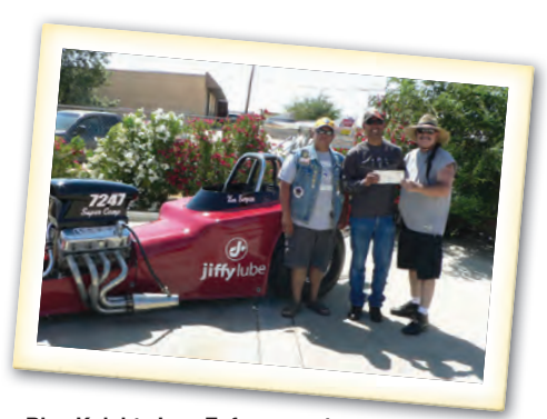
Blue Knights Law Enforcement, Hesperia, California.