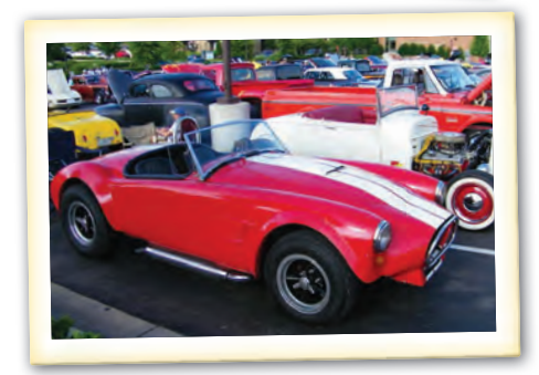
Providence Road Cruise-In, Mt. Juliet, Tennessee.