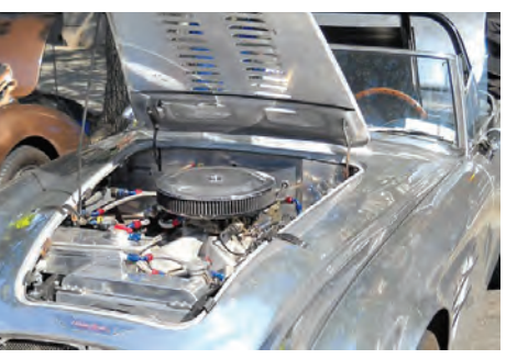
to small-block Chev- In the interest of keeping the silhouette and rolet transplants. I mildly flared wheelwells and a louvered bonnet pursued a number were fitted.

Internet and Hemmings in order to locate the ideal candidate that would benefit from a transplant. In 2002, I was lucky enough to find a BJ7 that had been raced at Bridgehampton and had been sitting in various Long Island garages since 1972 awaiting restoration. I had already planned chassis upgrades, which gradually solidified into custom framerails and a conversion to a narrowed Chrysler rear axle to replace the original underslung layout with a modern four-link coil-over shock design.