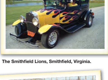
Toyota Speedway's Collector Car Appreciation Day, Irwindale, California.