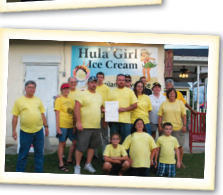
The Wayne County Cruisers, Goldsboro, North Carolina.