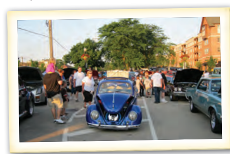
Downtown Downers Car Show, Downers Grove, Illinois.