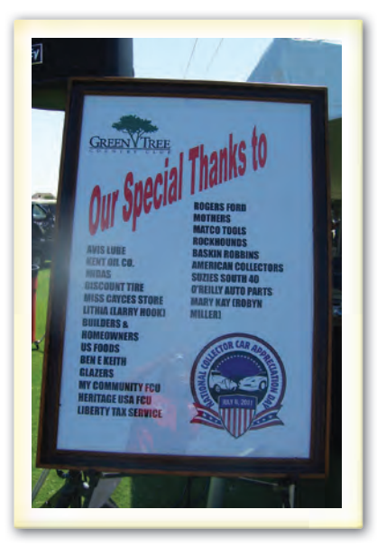
The Sixth Annual Car, Truck & Motorcycle Show, Midland, Texas.