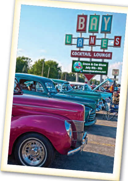
Be Cool Car Show, Bay City, Michigan.