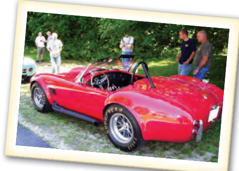
Acton Custom, Holderness, New Hampshire.