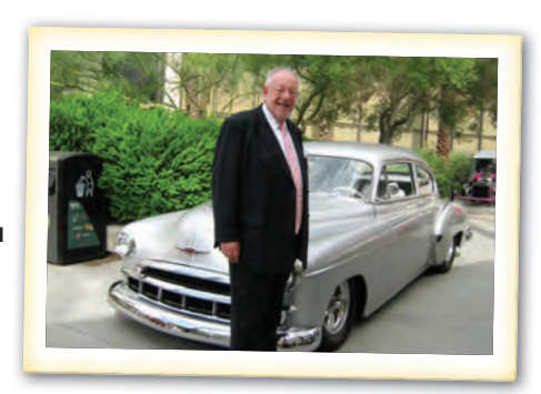
Las Vegas Mayor Oscar Goodman celebrating Collector Car Appreciation Day.