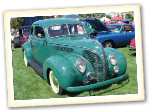
The 6th Annual Cops & Rodders Show, San Diego, California.