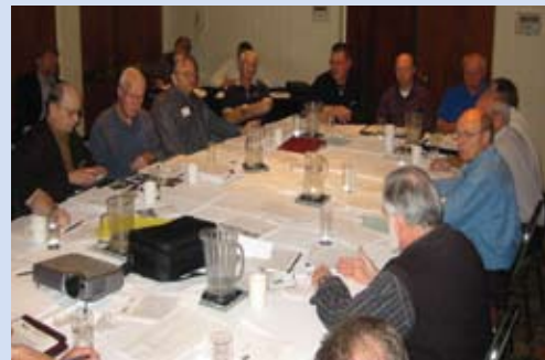
Annual meeting of the National Association of Automobile Clubs of Canada Corporation.