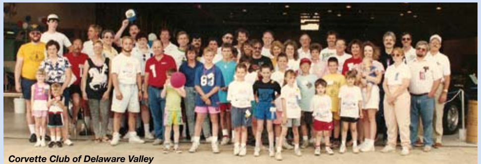
Corvette Club of Delaware Valley