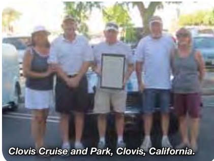
Clovis Cruise and Park, Clovis, California.