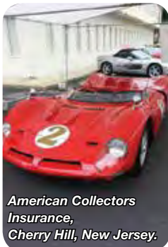
American Collectors Insurance, Cherry Hill, New Jersey.