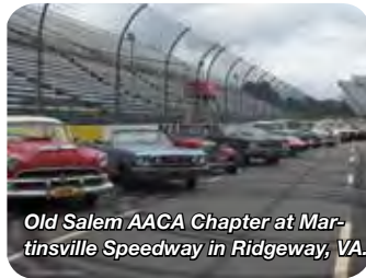
Old Salem AACA Chapter at Martinsville Speedway in Ridgeway, VA.