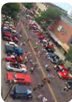
Central Nebraska Auto Club, Kearney, Nebraska.