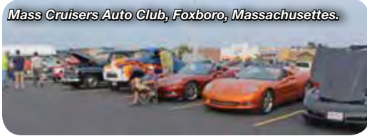
Mass Cruisers Auto Club, Foxboro, Massachusetts.