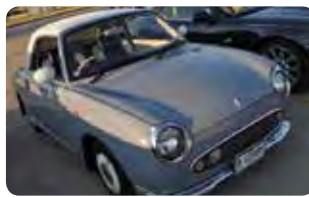
Dallas Area Classic Chevs, Dallas, Texas.