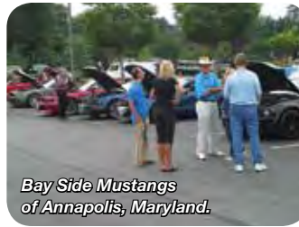
Bay Side Mustangs of Annapolis, Maryland.