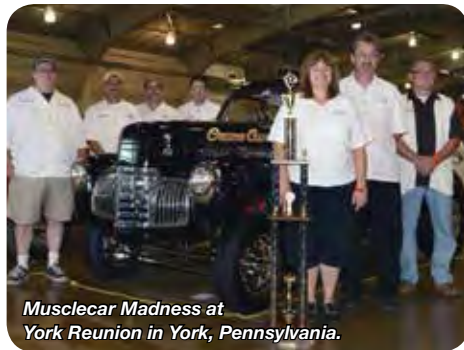
Musclecar Madness at York Reunion in York, Pennsylvania.