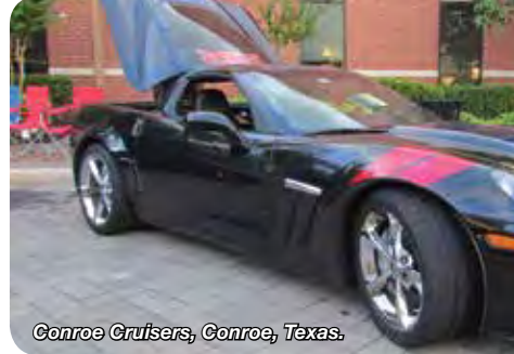
Conroe Cruisers, Conroe, Texas.