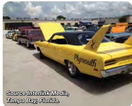
Source Interlink Media, Tampa Bay, Florida.