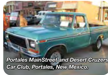
Portales MainStreet and Desert Cruzers Car Club, Portales, New Mexico.