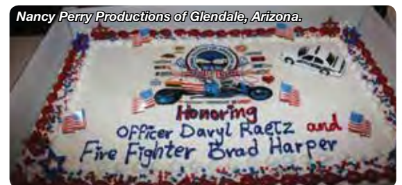
Nancy Perry Productions of Glendale, Arizona.