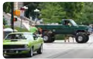
Dancin in the Streets, Lafayette, Indiana.