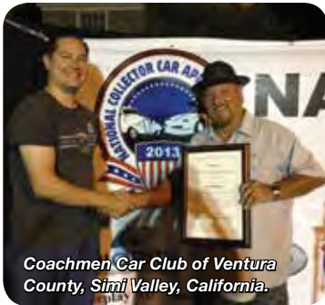
Coachmen Car Club of Ventura County, Simi Valley, California.