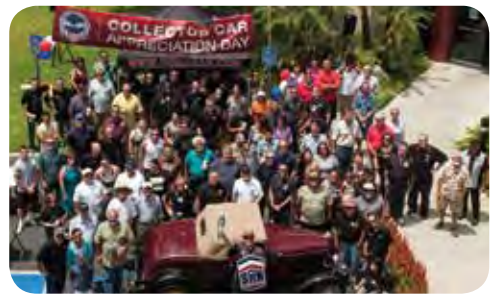
SEMA, Diamond Bar, California.