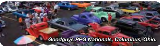
Goodguys PPG Nationals, Columbus, Ohio.