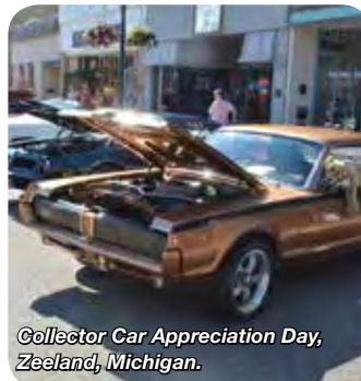
Collector Car Appreciation Day, Zeeland, Michigan.