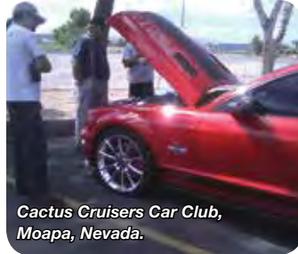
Cactus Cruisers Car Club, Moapa, Nevada.