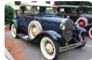
Model A Restorers Club, Mansfield, Massachusetts.