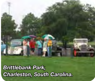
Brittlebank Park, Charleston, South Carolina.