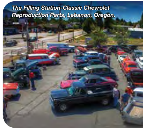
The Filling Station-Classic Chevrolet Reproduction Parts, Lebanon, Oregon.