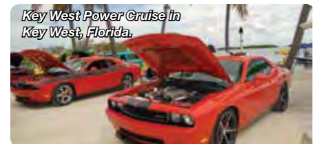
Key West Power Cruise in Key West, Florida.

This is a fantastic way to celebrate the cars and automotive artists that took them from the drawing board to reality. We in Australia share a common bond with U.S. car lovers. Our business is proud to represent Australia by holding this fun but historically significant event at our premises and look forward to many more to come!