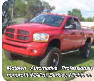
Motown Automotive Professionals nonprofit (MAPn), Berkley, Michigan.