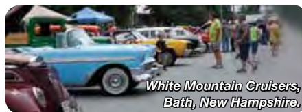
White Mountain Cruisers, Bath, New Hampshire.