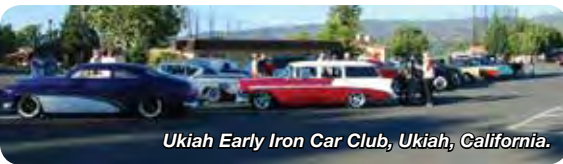
Ukiah Early Iron Car Club, Ukiah, California.