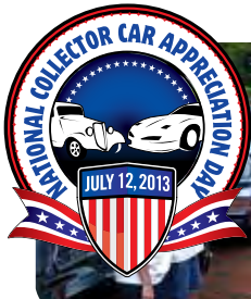
City of Longwood Car Cruise, Longwood, Florida,