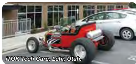
iTOK Tech Care, Lehi, Utah.