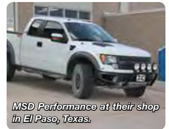
MSD Performance at their shop in El Paso, Texas.