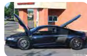
Memphis Classic Chevy Club, Bartlett, Tennessee.