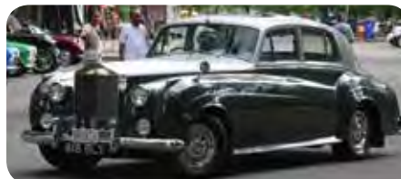
Valley Collector Car Club, Simsbury, Connecticut.