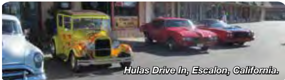
Hulas Drive In, Escalon, California.