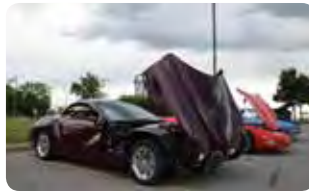
Cruise Night at the A&W in Calgary, Canada.