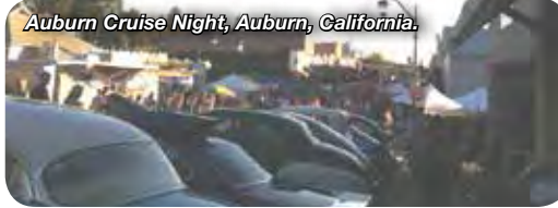
Auburn Cruise Night, Auburn, California.