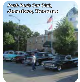
Push Rods Car Club, Jamestown, Tennessee.