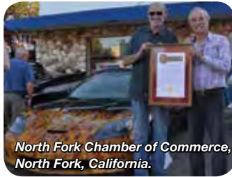
North Fork Chamber of Commerce, North Fork, California.