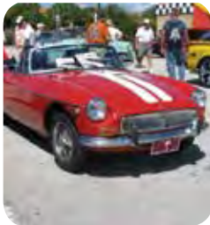
Veteran Motor Car Club of America SW Florida, Punta Gorda, Florida.