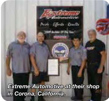
Extreme Automotive at their shop in Corona, California.