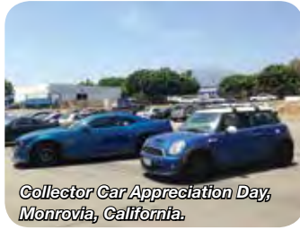
Collector Car Appreciation Day, Monrovia, California.

Official events included car club cruise-ins, open houses, specialty shows at automobile museums and "drive your collector car to work" displays. Scores of other unofficial events included car shows, picnics and other activities. A summary and photo gallery of these gatherings can be found online: semaSAN.com/CCAD Many thanks to all who participated in the festivities. The announcement of next year's event is coming soon!