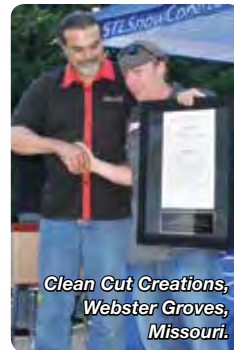
Clean Cut Creations, Webster Groves, Missouri.