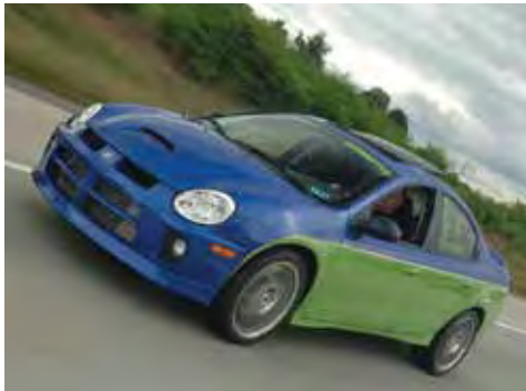
Delegate Howell enjoys driving this Dodge SRT-4.

I have been a strong advocate of SEMA-model legislation that helps car enthusiasts enjoy their hobby in a safe and responsible manner. I have worked to remove the tax burden on low-income car collectors, sponsored a bill to implement an objective exhaust noise testing program and crusaded against increased ethanol blends in gasoline. I'm