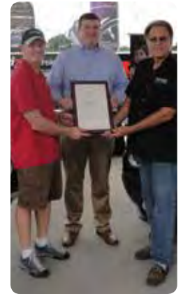
Carlisle Chrysler Nationals in Carlisle, Pennsylvania.