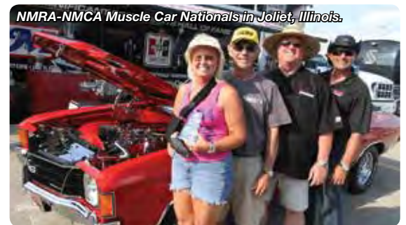
NMRA-NMCA Muscle Car Nationals in Joliet, Illinois.