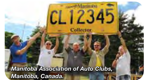
Manitoba Association of Auto Clubs, Manitoba, Canada.