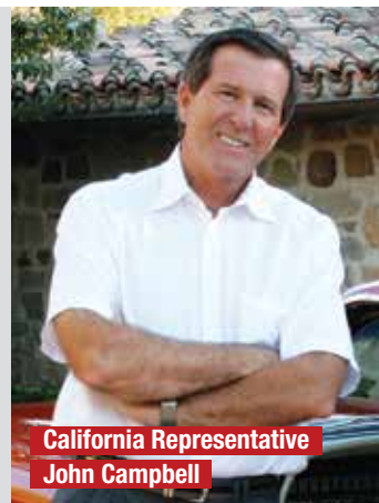
California Representative John Campbell

Did you know that some lawmakers are big fans of collector cars, vehicle exhibitions and auto racing? Many of these U.S. representatives and senators have joined the Congressional Automotive Performance and Motorsports Caucus. Likewise, state lawmakers have joined the companion State Automotive Enthusiast Leadership Caucus. These caucuses help identify lawmakers with an interest in the historical legacy of the automobile. Many of these legislators have proactively sought to protect the hobby by improving existing motor-vehicle statutes and creating new programs to safeguard and expand it. These forums represent an important method to raise the hobby's profile on Capitol Hill, in state capitols and in the public's eyes. State Caucus members number approximately 600 legislators from all 50 states. The Congressional Caucus counts 70 U.S. senators and representatives among its ranks. Lawmakers who have served in the states often are later elected to represent their states and districts in Congress. Pictured are a few of the State Caucus alumni who are now serving in Washington and have joined the Congressional Caucus. For a full listing of caucus members, visit www.semaSAN.com