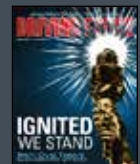
Publication: Monthly to Quarterly