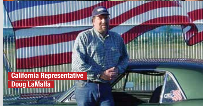
California Representative Doug LaMalfa