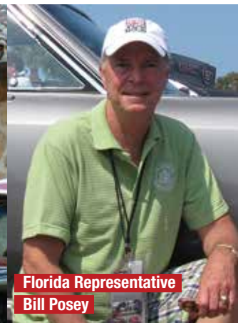
Florida Representative Bill Posey