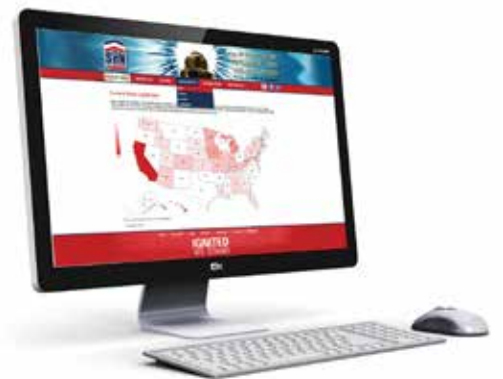
The list of current state legislation features all active bills being tracked nationwide. An interactive U.S. map indicates the jurisdictions with the most pending initiatives.

While the process of monitoring a bill's journey may begin with staff in Washington, D.C., your efforts are what keeps our beloved hobby